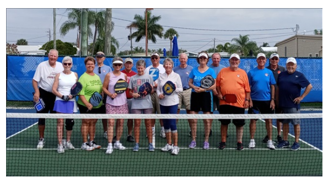
February Tournament - Morning